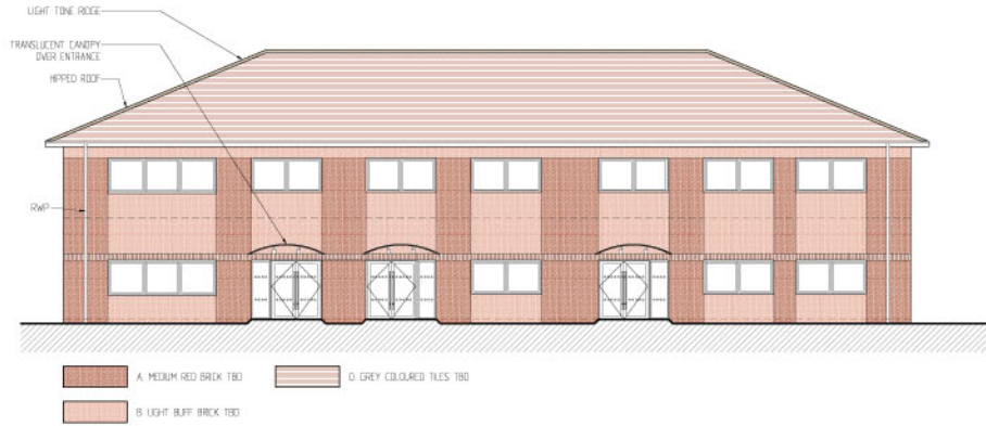
1 FRONT ELEVATION SCALE 1:100@A1/1:200@A3