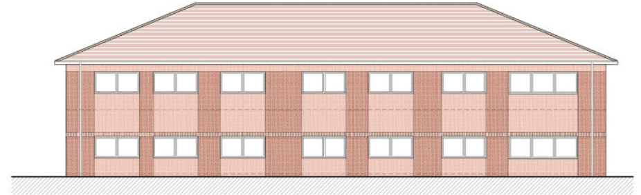
2 REAR ELEVATION SCALE 1:100@A1/1:200@A3